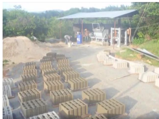
POULO CONDOR project in Con Dao (using local sea sand and ECO CSSB additive application in producing unburnt bricks)