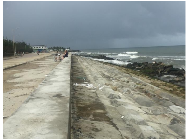
5/ In September, 2017 , the Deputy Minister of Construction Department visited the embankment project - Song Bien - Can Gio Province (completed 2005)