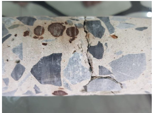
Reinforced concrete is drilled April 20, 2019 – Item: wharf (Phuong Nam Pearl Island Construction - Can Gio completed in 2004)